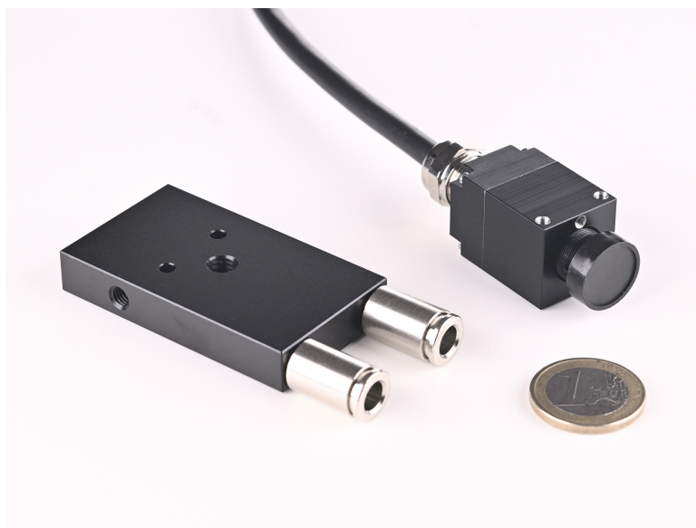
*Picture shows camera and optional cooling plate

The camera cables can be ordered up to 50 m length. With it, e.g., the camera can be controlled by a remote control station or a complex cable transfer in the machine can be carried out.